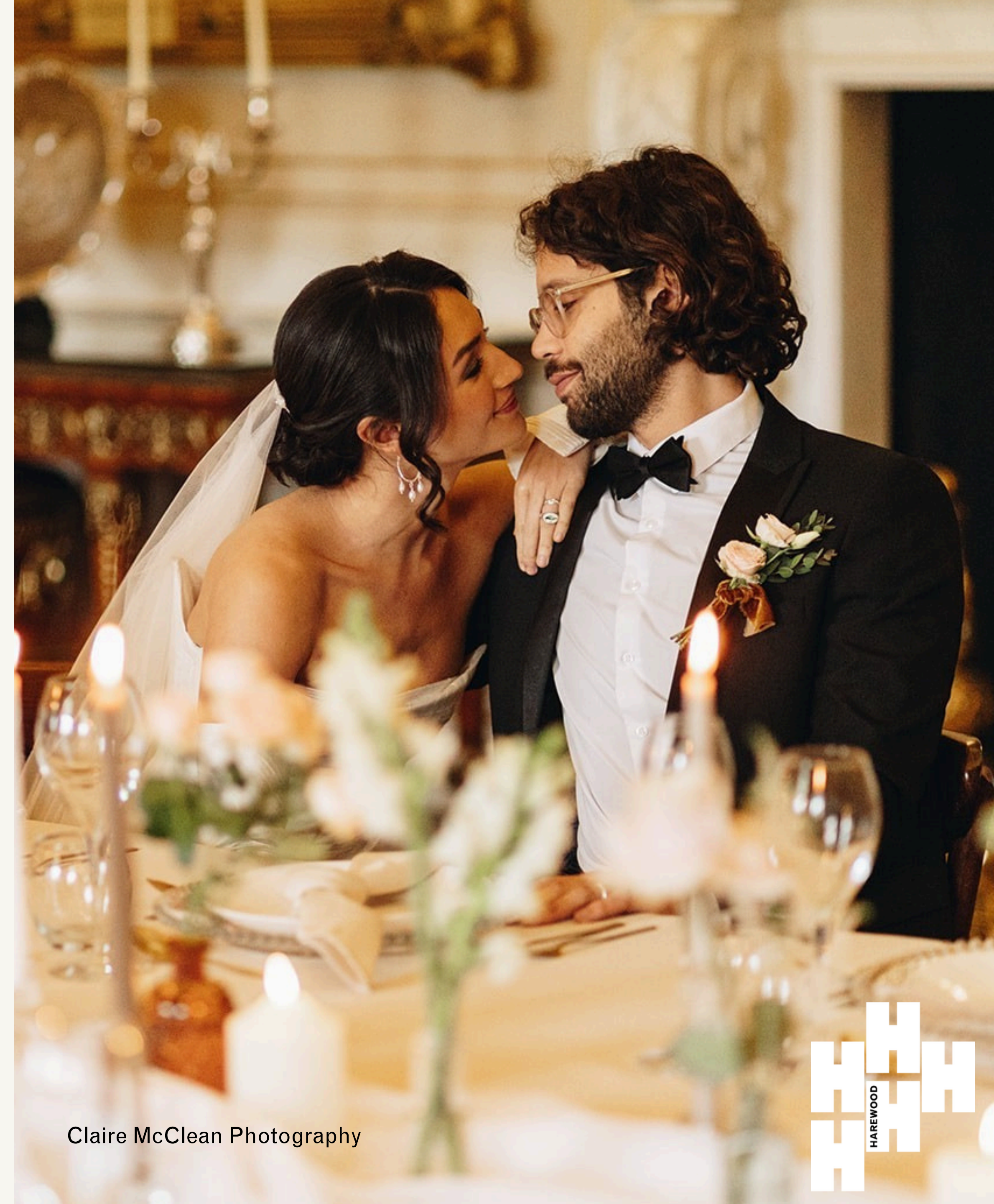
Claire McClean Photography