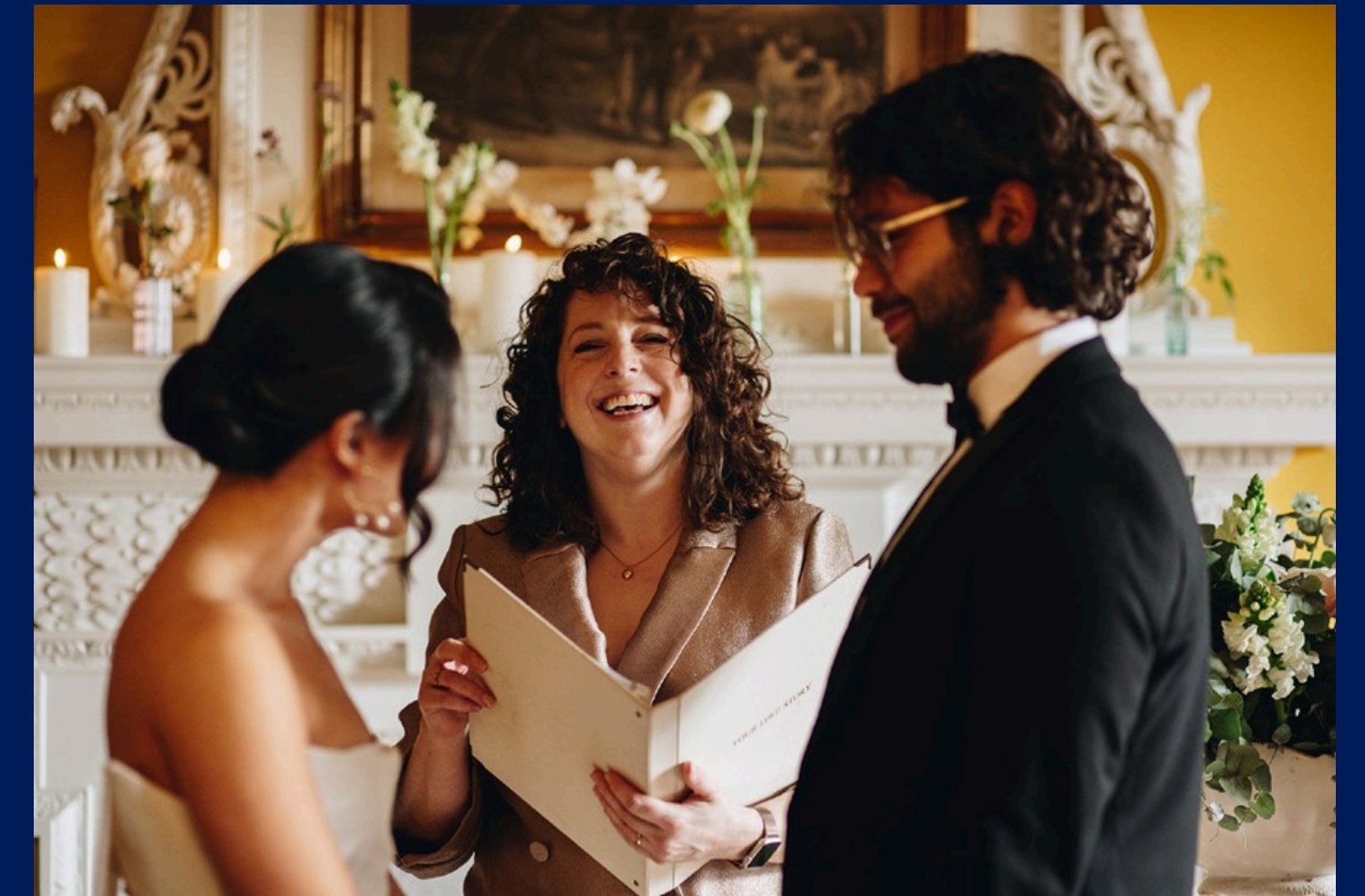
Claire McClean Photography

With over a decades experience he's captured hundreds of weddings across the UK and Europe. From some of the finest homes and venues in Yorkshire, to elaborate nuptials overseas.