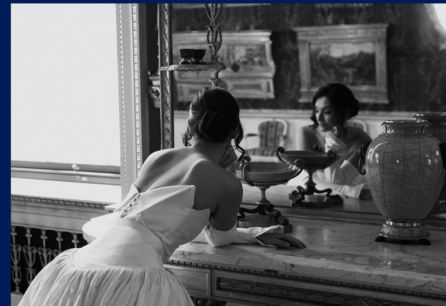
Claire McClean Photography

Our clients are central to all we do, we get to know you and what your vision and needs are to ensure the success of your special celebration.