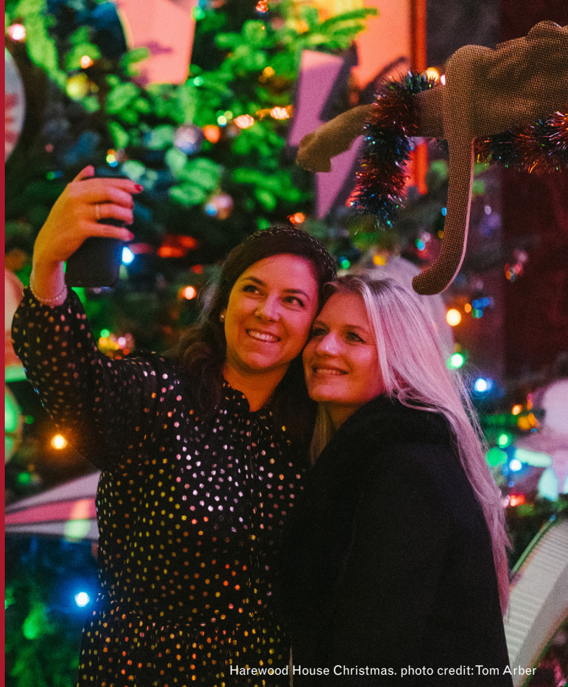
Harewood House Christmas. photo credit: Tom Arber

For a more informal Christmas party, our Stretch Tent is dressed for the occasion, creating an après-ski vibe whilst guests snack on a range of delicious menus designed to entertain, from live cooking displays to a s'mores station.