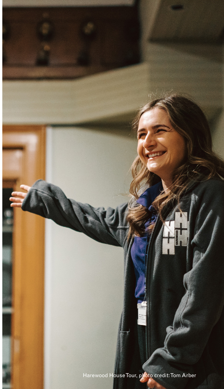
Harewood House Tour, photo credit: Tom Arber

We also work with recommended local suppliers to provide a wide range of other activity options to enhance any event.