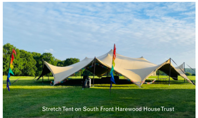
Stretch Tent on South Front Harewood House Trust