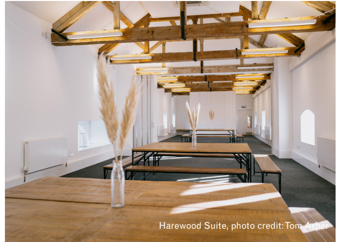
Harewood Suite, photo credit: Tom Archer

For presentations or speeches, the suite is equipped with complimentary Wi-Fi and AV equipment including projector, wall screen, lectern, and microphone.