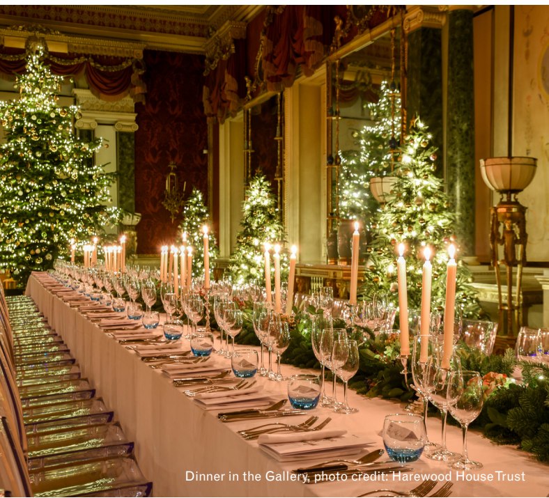
Dinner in the Gallery

Wherever possible, our in-house team use produce sourced from and our very own Walled Garden. This means that our menus are seasonal and food mileage is reduced. What can't be sourced from Harewood, is sourced from a network of local suppliers.