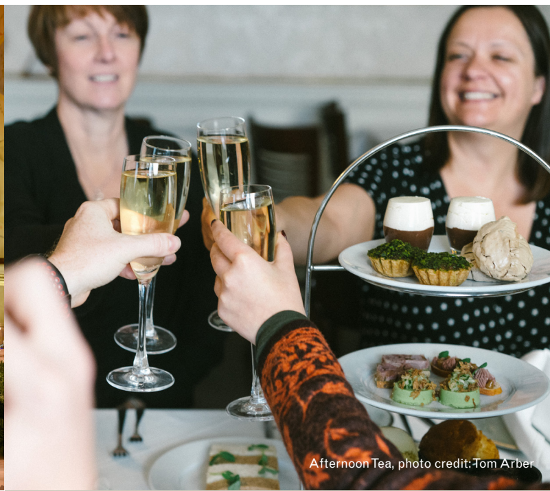
Afternoon Tea