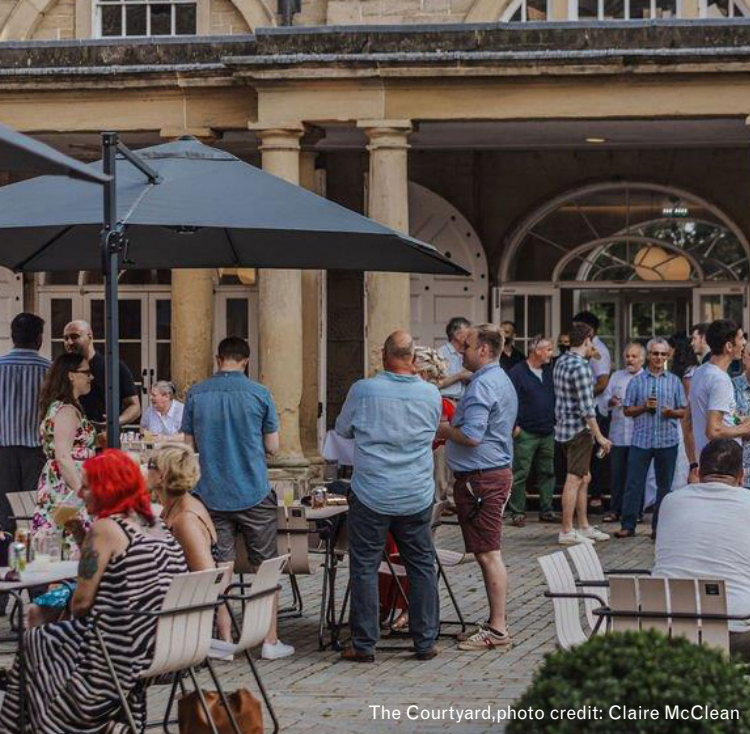
The Courtyard