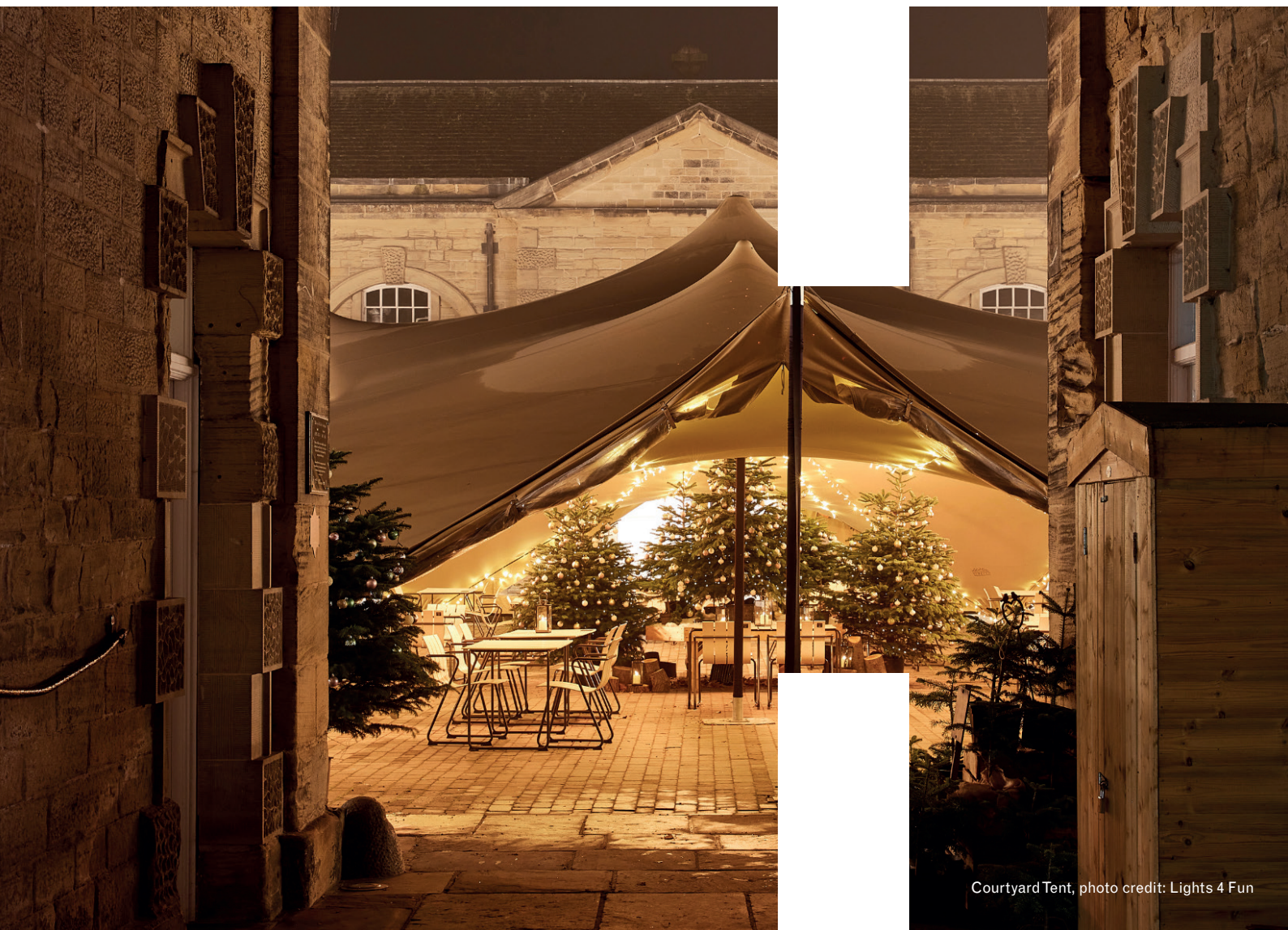
Courtyard Tent