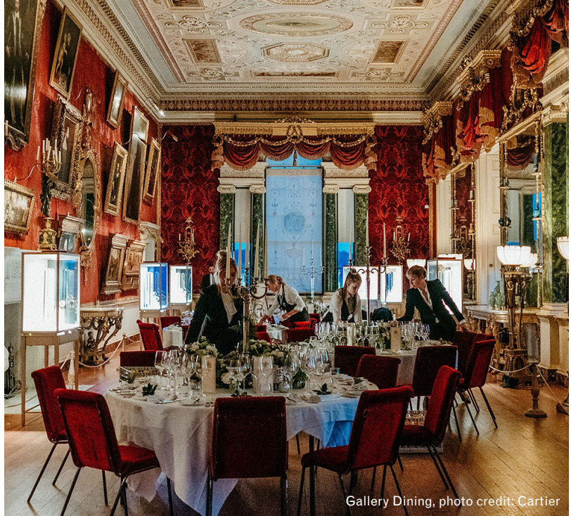
Gallery Dining, photo credit: Cartier