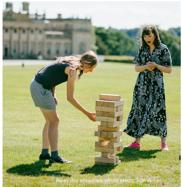
Away day activities

Our selection of activities ensures that we have something to suit all requirements, whether that's to promote teamwork, get colleagues active or to promote wellbeing. From archery with the House as your backdrop, yoga in the Gallery surrounded by Renaissance masterpieces or inflatable assault courses, the possibilities are endless.