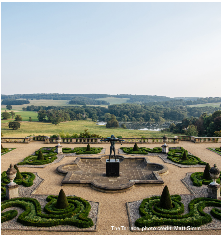
The Terrace, photo credit: Matt Simm