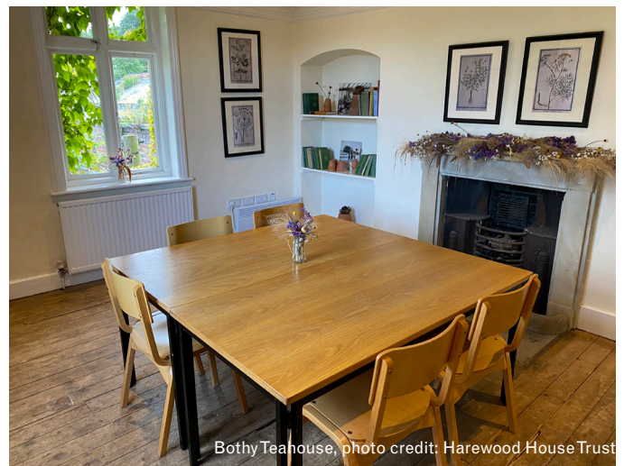
Bothy Teahouse