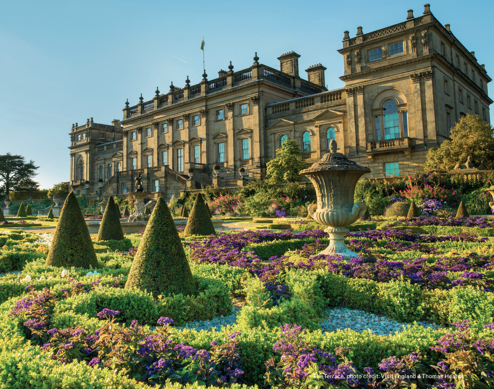
The Terrace, photo credit: Visit England & Thomas Heaton

Harewood is an 18th century house set within acres of extensive parkland, located in the heart of Yorkshire, only 7 miles away from central Leeds and Harrogate . A truly unforgettable location for events with a difference.