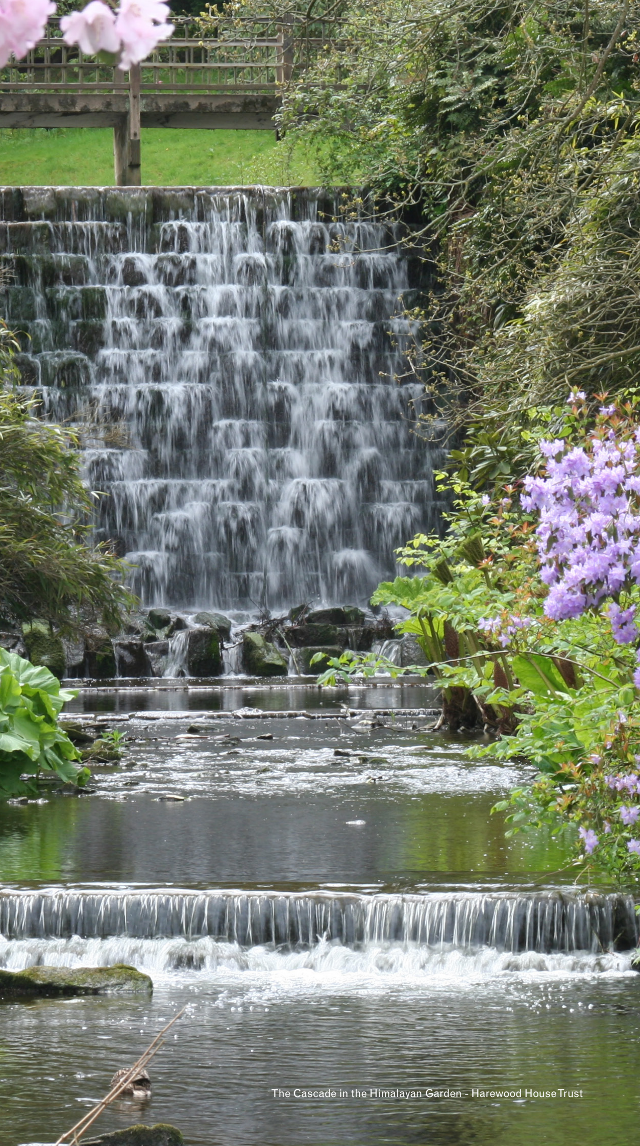
The Cascade in the Himalayan Garden - Harewood House Trust