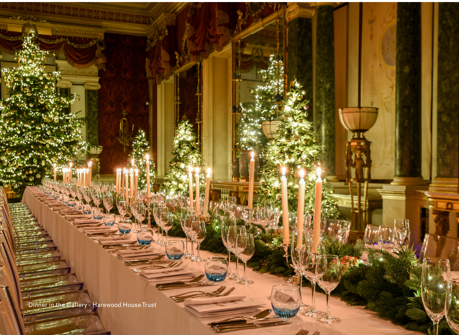
Dinner in the Gallery - Harewood House Trust