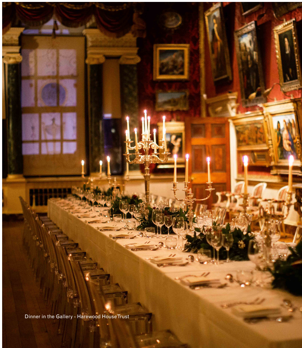
Dinner in the Gallery - Harewood House Trust

Whilst sipping a chilled glass of fizz, guests have the option to wander the State Rooms at their leisure and make their way out onto the Terrace to enjoy the breath-taking views overlooking the 'Capability Brown' landscape and lake .