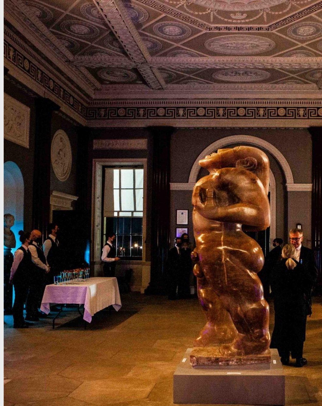
The Entrance Hall